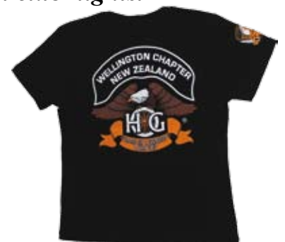
T-Shirt $45 Back view of sleeve with chapter patch on sleeve

Lots more available, pins patches ladies TShirts etc. etc.