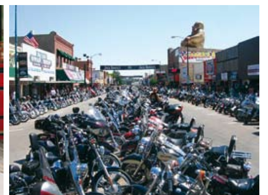
Main Street Sturgis