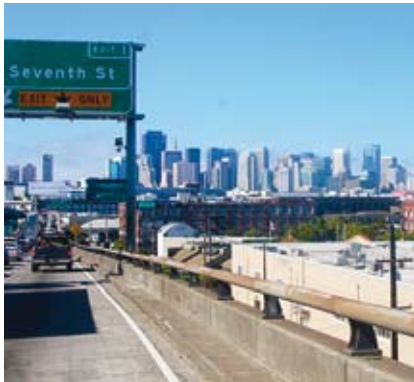
Entering San Francisco