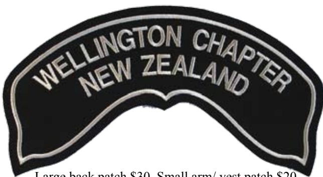
Large back patch $30 Small arm/ vest patch $20