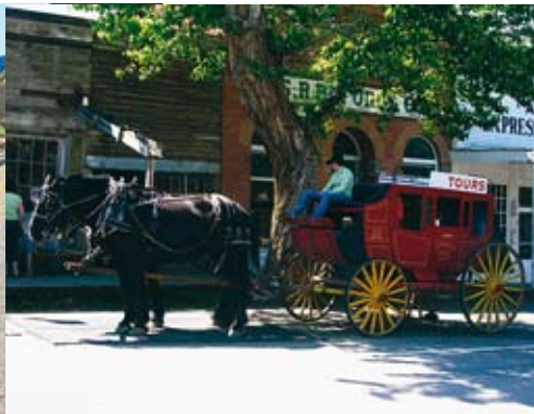
Stagecoach in Virginia City