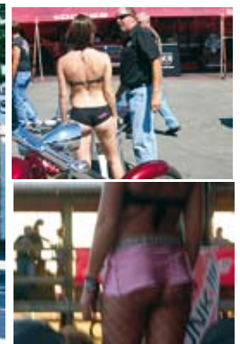
Eye candy @ Sturgis