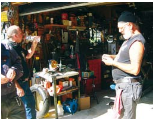
The Desert Doctor fitting a new tyre