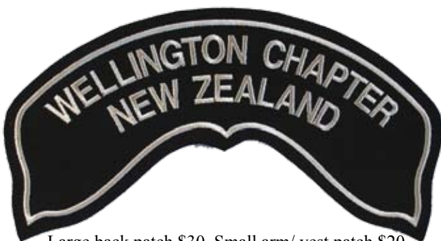
Large back patch $30 Small arm/ vest patch $20