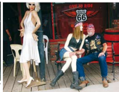
Relaxing on Route 66