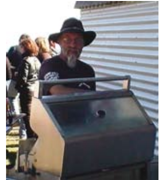
Mine Host, cooking meat to perfection