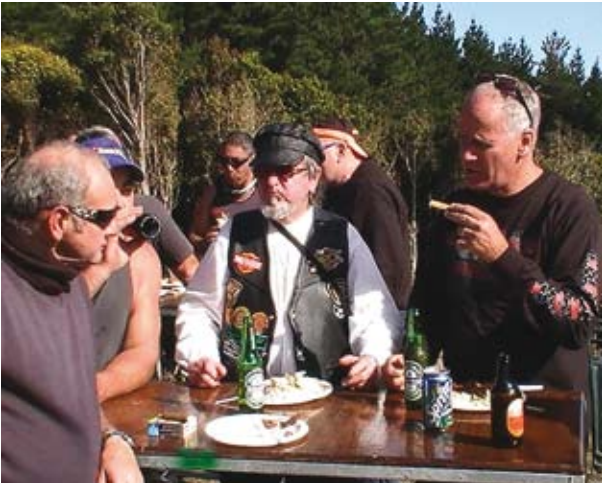
The state of the economy being discussed, Yeah Right!