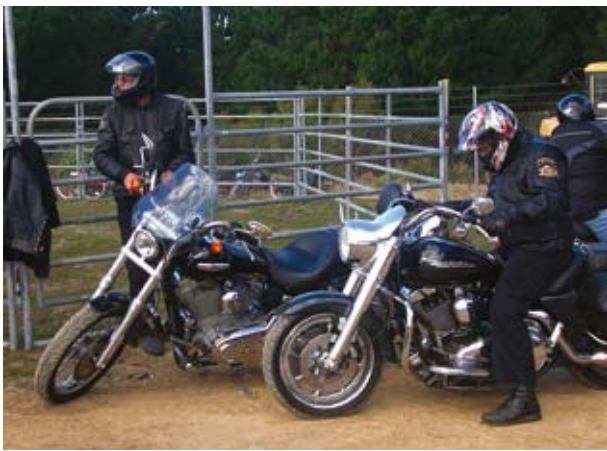
First to arrive, gravel roads no worry to us!