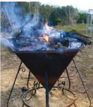
I think this fire burned all night! but the sun shone and a great day was had by all. Thanks Brian.