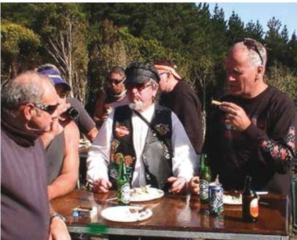
The state of the economy being discussed, Yeah Right!