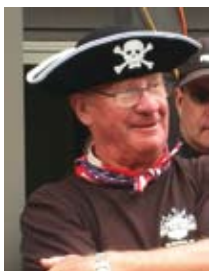
At least I won a hat!