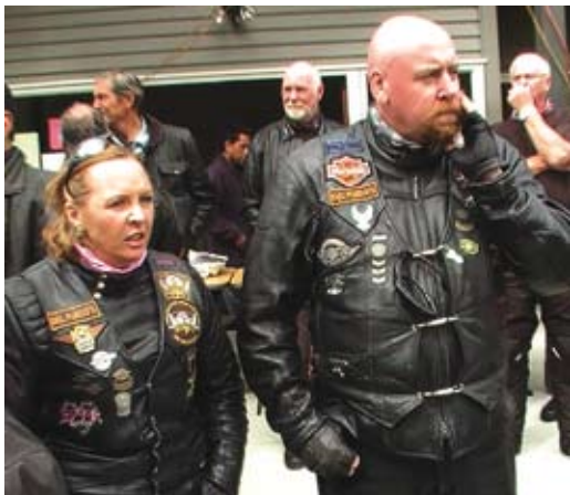
Dealt the wrong cards again Sooty!

Don't tell any one but I hear Warwick run out of petrol. Lynne CMF