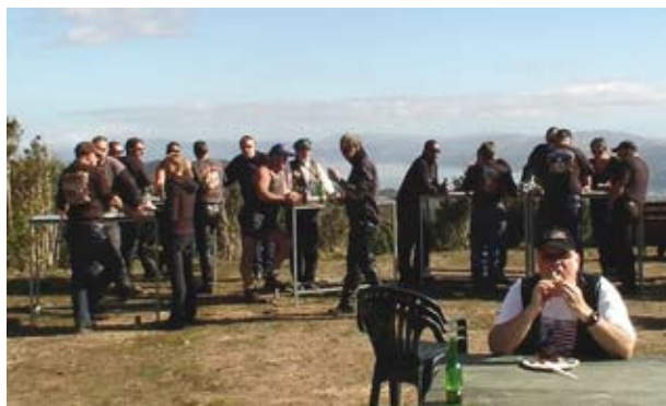
The tables are set up and the eating begins!