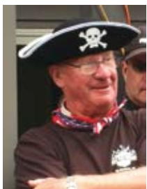
At least I won a hat!