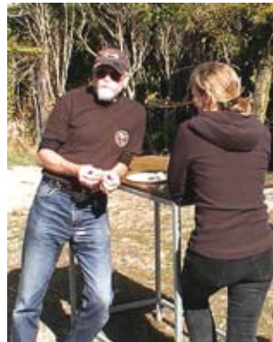
Talking s**t probably