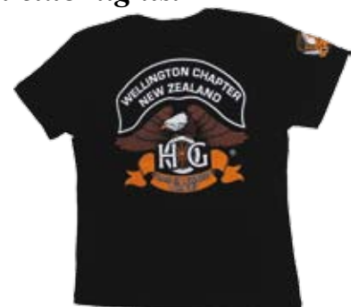
T-Shirt $45 Back view with chapter patch on sleeve

Lots more available, pins patches ladies TShirts etc. etc.