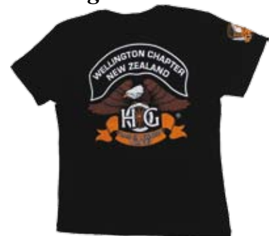
T-Shirt $45 Back view with chapter patch on sleeve

Lots more available, pins patches ladies TShirts etc. etc.