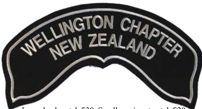
Large back patch $30 Small arm/ vest patch $20

From the merchandise shop. Buy online or see Tana on club nights.