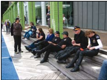
Waiting to go on the launch out on Milford Sound