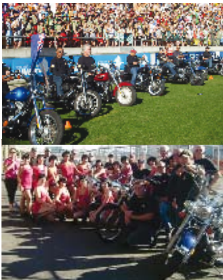
At the Sevens

There is a phone at the camp for local or incoming calls if you need to be contactable. You can divert your cellphone to it. 06-3294876