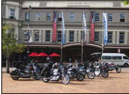
Can we park at the Octagon? Yes, if one of us knows the council guy having coffee at the next table!