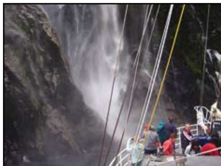
Getting close to the action