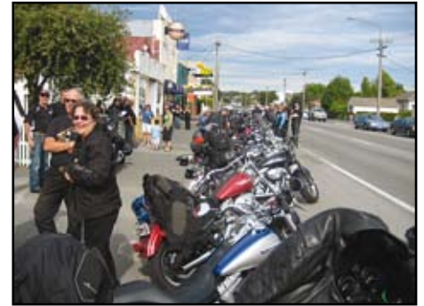
A stop at Gore for lunch and a chance to take a couple of layers off!