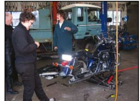
Oh No! a bloody puncture and at Fox!