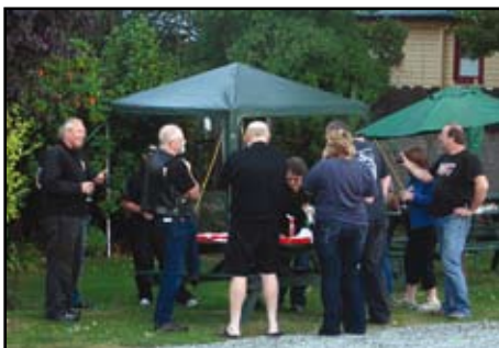
Fish & Chips at Wanaka